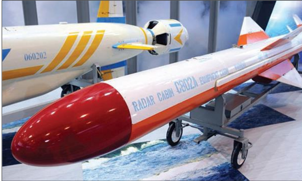
Figure 5. Reported Image of Anti-Ship Cruise Missile (ASCM)