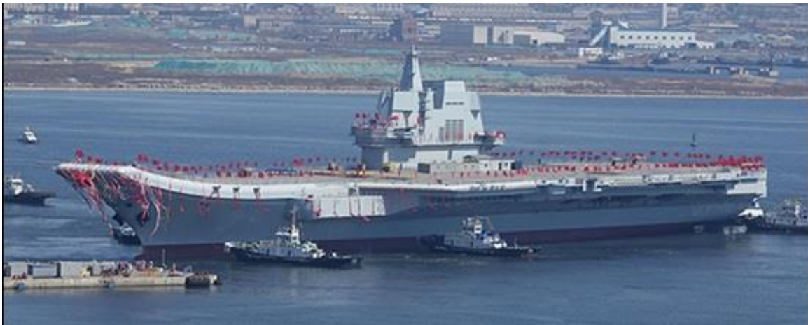
Figure 11. Shandong (Type 002) Aircraft Carrier