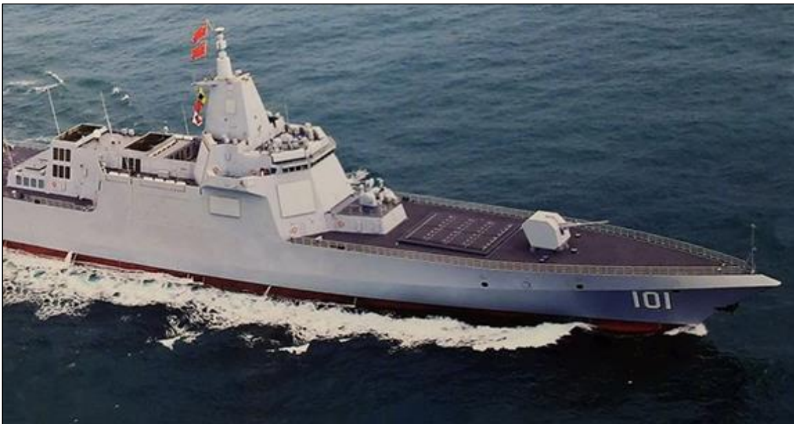
Figure 18. Renhai (Type 055) Cruiser (or Large Destroyer)