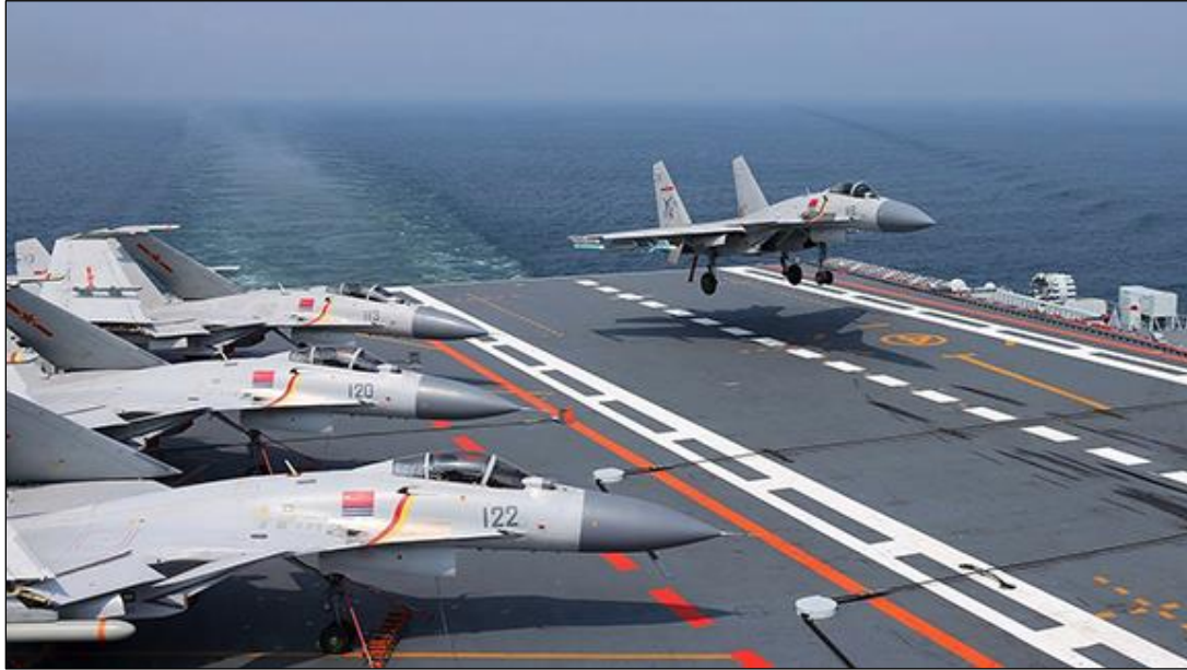
Figure 15. J-15 Flying Shark Carrier-Capable Fighter