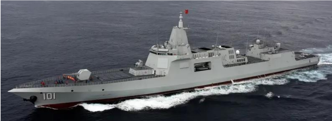
Figure 17. Renhai (Type 055) Cruiser (or Large Destroyer)