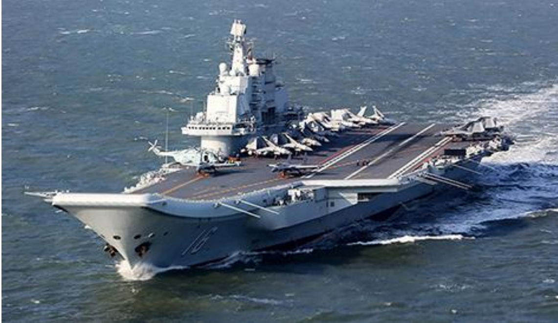
Figure 10. Liaoning (Type 001) Aircraft Carrier