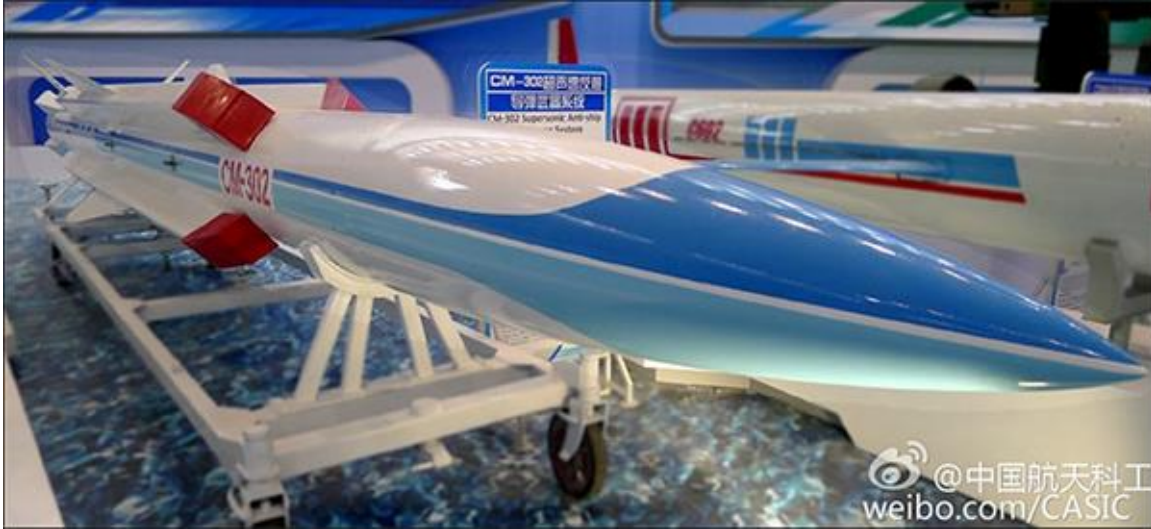
Figure 3. Reported Image of Anti-Ship Cruise Missile (ASCM)

Source: Detail of photograph accompanying Pierre Delrieu, "China Promotes Export of CM-302 Supersonic ASCM," Asian Military Review , July 3, 2017. (The article states "This is an article published in our December 2016 Issue.") The article states "According to Chinese news media reports, the China Aerospace Science and Industry Corporation (CASIC) CM-302 missile is being marketed for export as "the world's best anti-ship missile." The missile was showcased at the Zhuhai air show in the southern People's Republic of China (PRC) in early November [2016], and is advertised as [a] supersonic Anti-Ship Missile (AShM) [ASCM] which can also be used in the land attack role. The report, published by the national newspaper China Daily , suggest[s] that the CM-302 is the export version of CASIC's YJ-12 supersonic AShM, which is in service with the PRC's armed forces.")