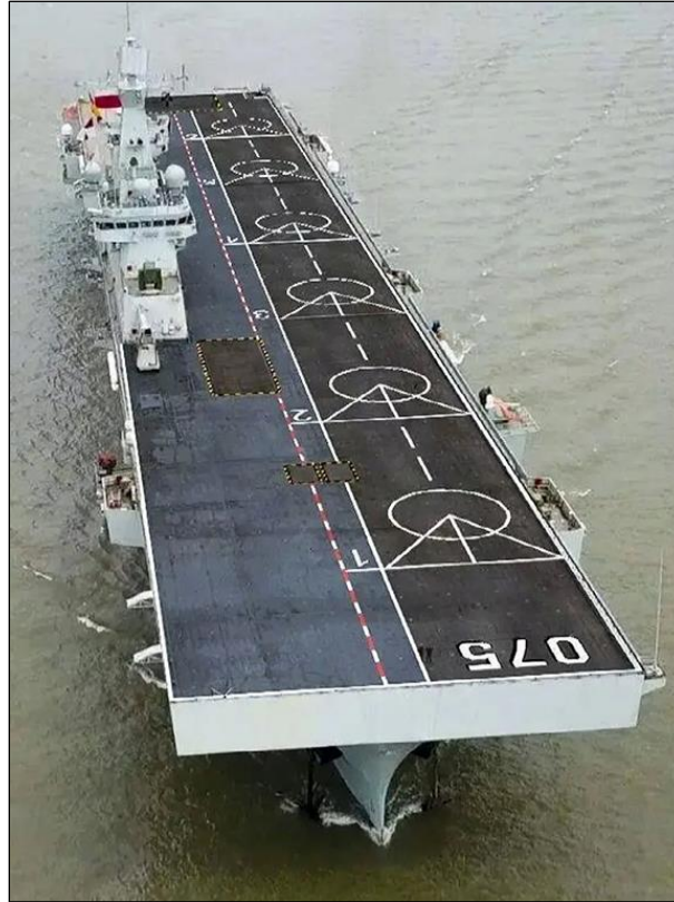
Figure 25. Type 075 Amphibious Assault Ship

Possible Type 076 Catapult-Equipped Amphibious Assault Ship.