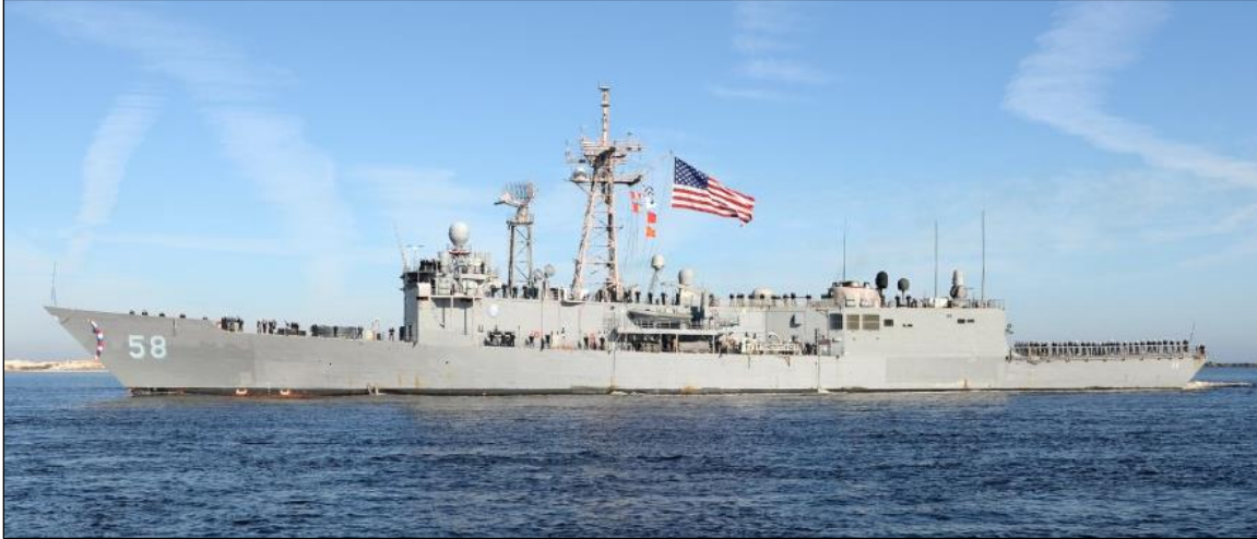
Figure 1. Oliver Hazard Perry (FFG-7) Class Frigate